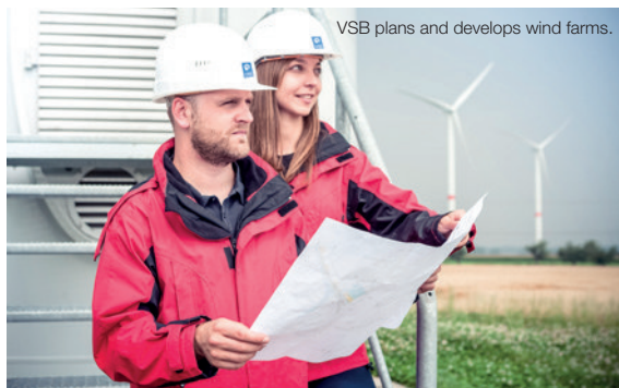
VSB plans and develops wind farms.