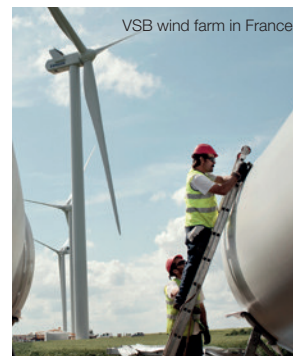
VSB wind farm in France.