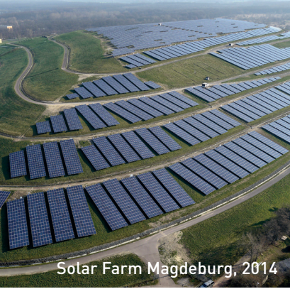
Solar Farm Magdeburg, 2014

„For us VSB is a reliable service provider and partner in the Solar sector, VSB performs Asset Management of the Solar Farm on the former landfill site in Magdeburg and with this challenging site VSB is always reliably at our side as a technical manager.“