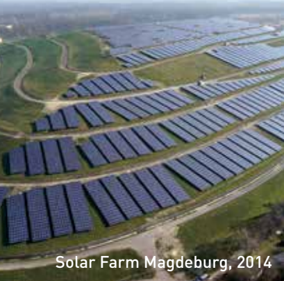
Solar Farm Magdeburg, 2014

„For us VSB is a reliable service provider and partner in the Solar sector, VSB performs Asset Management of the Solar Farm on the former landfill site in Magdeburg and with this challenging site VSB is always reliably at our side as a technical manager.“