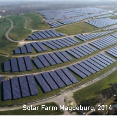
Solar Farm Magdeburg, 2014

„For us VSB is a reliable service provider and partner in the Solar sector, VSB performs Asset Management of the Solar Farm on the former landfill site in Magdeburg and with this challenging site VSB is always reliably at our side as a technical manager.“